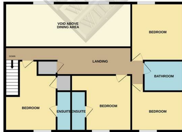
TOTAL FLOOR AREA : 2291 sq.ft. (212.8 sq.m.) approx.

Whilst every attempt has been made to ensure the accuracy of the floorplan contained here, measurements of doors, windows, rooms and any other items are approximate and no responsibility is taken for any error, omission or mis-statement. This plan is for illustrative purposes only and should be used as such by any prospective purchaser. The services, systems and appliances shown have not been tested and no guarantee as to their operability or efficiency can be given. Made with Metropix ©2024