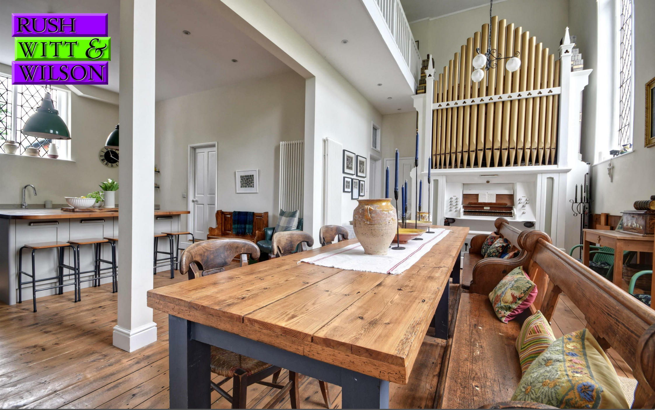
The Old Chapel, Beckley Methodist Church, Main Street, Beckley, East Sussex, TN31 6RN. £585,000 Freehold